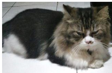
Fig. 1 Cat patient named Memed

A mixed Persian cat named Memed came to the RVet Bogor clinic. This cat is 1.5 years old, a gray mix of white and male. Memed came with grievances of diarrhea for six days with the consistency of watery stools, without blood, and not accompanied by vomiting. During diarrhea, Memed didn't lose appetite and drink. The owner explained the cat was often released and drank water carelessly, including raw water and sewage. In addition, the owner also provided information that his cat had received a complete vaccine. The clinical examination showed Memed's weight was 3.4 kg, body temperature was 38 °C, heart rate was 92 times/minute, and respiratory rate 32 times/minute. Memed looks limp and pale. The clinical examination data of Memed shows that Memed has lost weight.