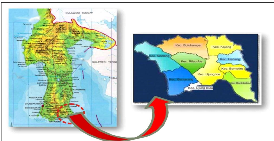
Figure 3. Map of Bulukumba in South Sulawesi Province

The present study focuses discussion on the Konjo situation since this language has been rarely documented, while the Buginese variety is one of the major ethnic languages in South Sulawesi and well documented.