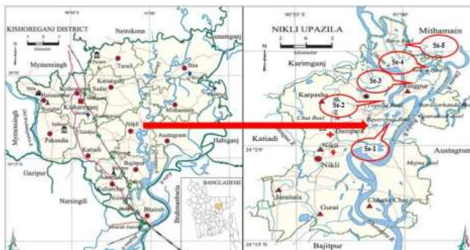
Figure 1. Map showing the study area at Baro haor of Kishoreganj in Bangladesh

The study was conducted in haor areas of Nikli upazila under Kishoreganj district in Bangladesh, during the period from August 2016 to July 2017. The study area was approximately within latitude between 24°15' and 24°27'N and longitudes between 90°52' and 91°03'E (Fig. 1). The Kishoreganj district with an area of 2688.59 km 2 is bounded by Netrokona and Mymensingh districts on the north, Narsingdi district on the southwest and Brahmanbaria district on the southeast, Sunamgonj and Habiganj districts on the east, Gazipur and Mymensingh districts on the west. The study area was divided into five different sampling stations denoted as: St-1 (Bayershuil beel), St-2 (Tegulia beel), St-3 (Singpur beel), St-4 (Neora beel) and St-5 (Bara beel).