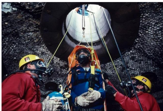
Fig.1. work in confined space areas [1].

This study will use the Confined Space Risk Analysis method. This method can identify risks comprehensively by analyzing all the work risk factors in confined spaces, categorizing interventions and rescue conditions based on specific criteria, evaluating external rescue needs, and determining if the residual risk is acceptable [6]. The research uses the Bowtie Analysis method for causes, consequences, and barriers.