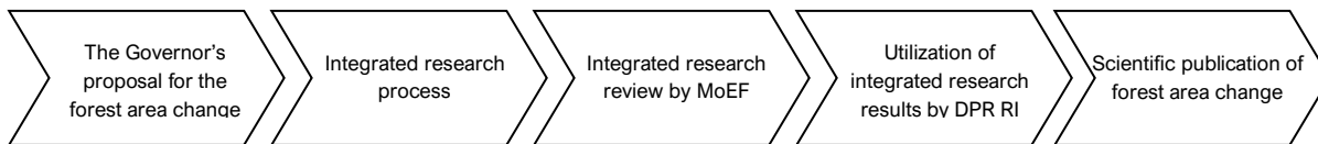
Figure 2. Mechanism for Changing DPCLS Forest Areas

to conduct a comprehensive scientific study about the forest changes and assessments on their potential adverse impacts. As defined in the regulation, the team is composed of government institutions which “possess scientific competence and authority” and related stakeholders. However, it is usually dominated by the ministry’s experts from biophysical, socio-cultural, legal, and institutional aspects. In addition, the team’s work is financed by the Provincial Government, and the members are remunerated based on certain standards, covering meetings and data analysis, fieldwork, transportation, and accommodation. Hence, its independence can be in question.